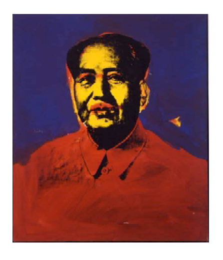
Mao 1973 synthetic polymer paint and silkscreen ink on linen 50 x 42 inches Private collection, Courtesy Faggionato Fine Art, London