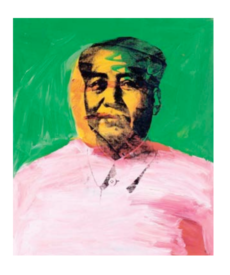
Mao 1973 synthetic polymer paint and silkscreen ink on canvas 50 x 42 inches Private collection