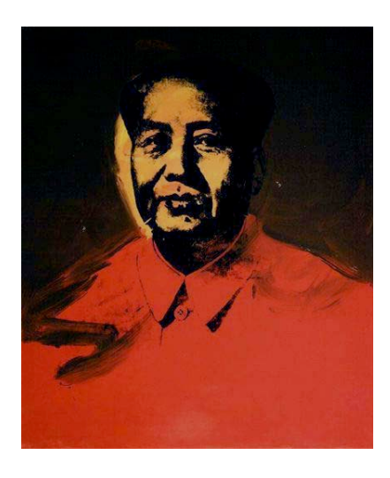
Mao 1973 synthetic polymer paint and silkscreen ink on canvas 12 x 10 inches Collection M. Voena