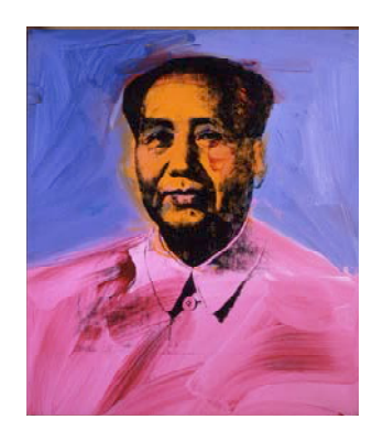
Mao 1973 synthetic polymer paint and silkscreen ink on canvas 26 x 22 inches Mia and Patrick Demarchelier