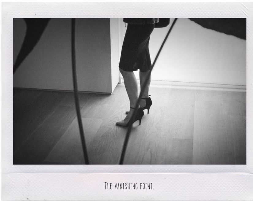
(Lucio Fontana's Concetto Spaziale, Attese, 1957 provides the frame for said vanishing point.)