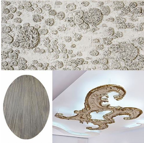
Clockwise from top: "Untitled Sponge Relief" (1957) by Yves Klein, "Soffitto" (1949) by Lucio Fontana, "Untitled" (1971) by Cy Twombly

These "proportions" will be essential to the inaugural show, Audible Presence: Lucio Fontana, Yves Klein, Cy Twombly , a well-considered thematic exhibition tracing the aesthetic links between the three artists and their mid-century explorations into materiality and the relationships of painting and sculpture to sound and music. The title is a reference to a paper Klein wrote about his Monotone-Silence Symphony , which will be performed in conjunction with the opening for the first time in the U.S. (at 8 p.m. on September 18 at the Madison Avenue Presbyterian Church). First presented in the spring of 1960 at Galerie Internationale d'Art Contemporain in Paris—with three of Klein's "living brushes" painting blue streaks across papers spread about the floor and walls—the 40-minute piece employs 32 musicians and as many as 40 singers who hold a single tone for 20 minutes then remain dead silent for another 20. "The drawn-out, continuous sound, deprived of its attack and of its conclusion, created a sensation of vertigo, an aspiration of sensibility, outside of time," wrote Klein. "It was silence—an audible presence!"