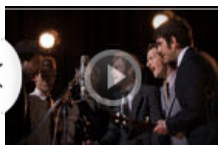
The Punch Brothers, Marcus Mumford sing "The Auld ...