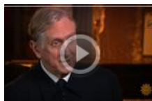
T Bone Burnett on Greenwich Village in the '60s