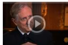
T Bone Burnett on the songs of "Inside Llewyn Davi...