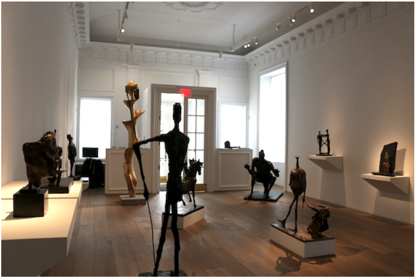
Germaine Richier, installation view