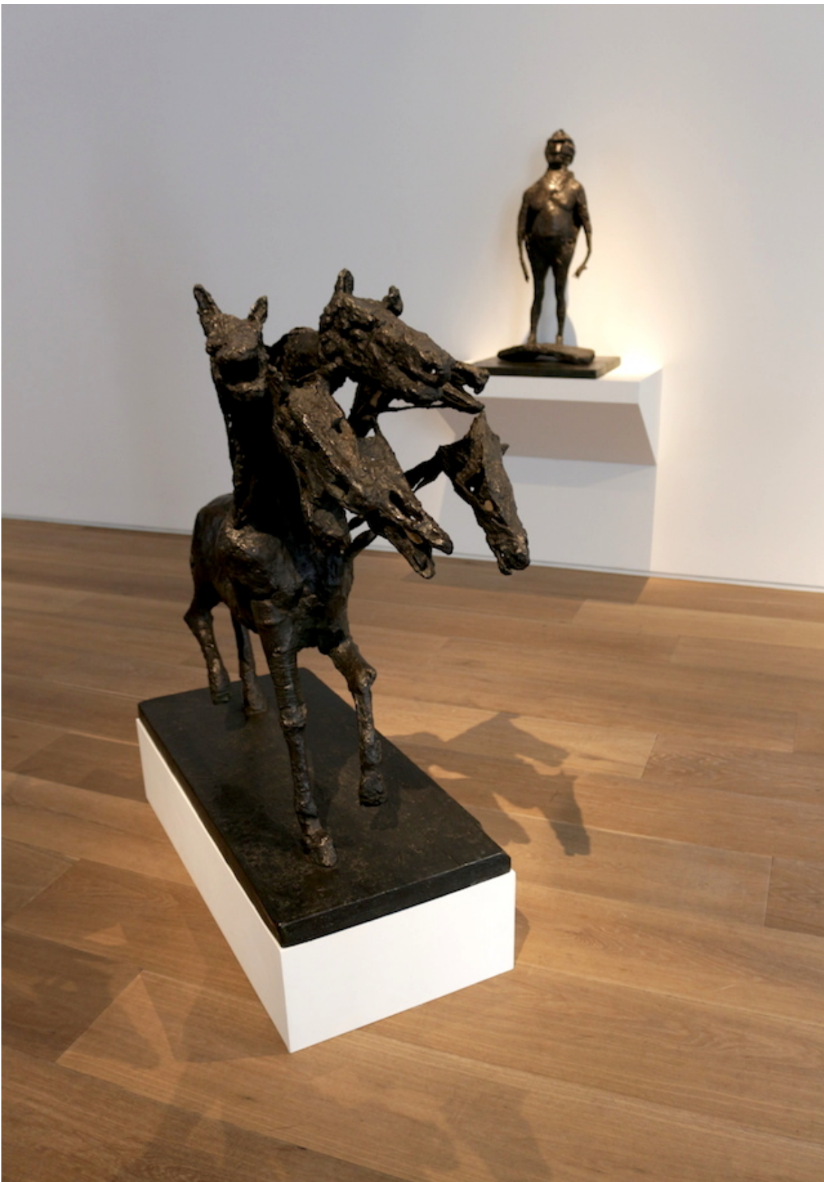
Germaine Richier, "Le Cheval à six têtes, grand" (1954-56)