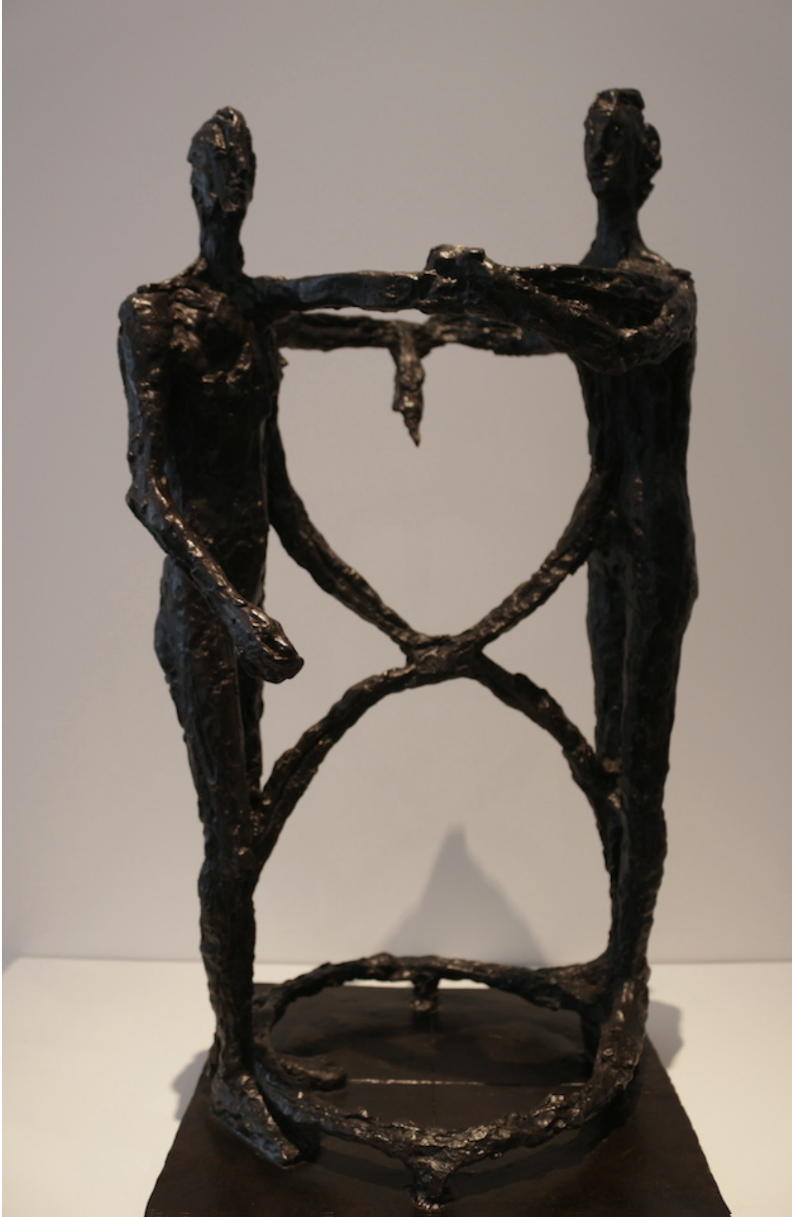
Germaine Richier. "Le Sablier III" (1953)