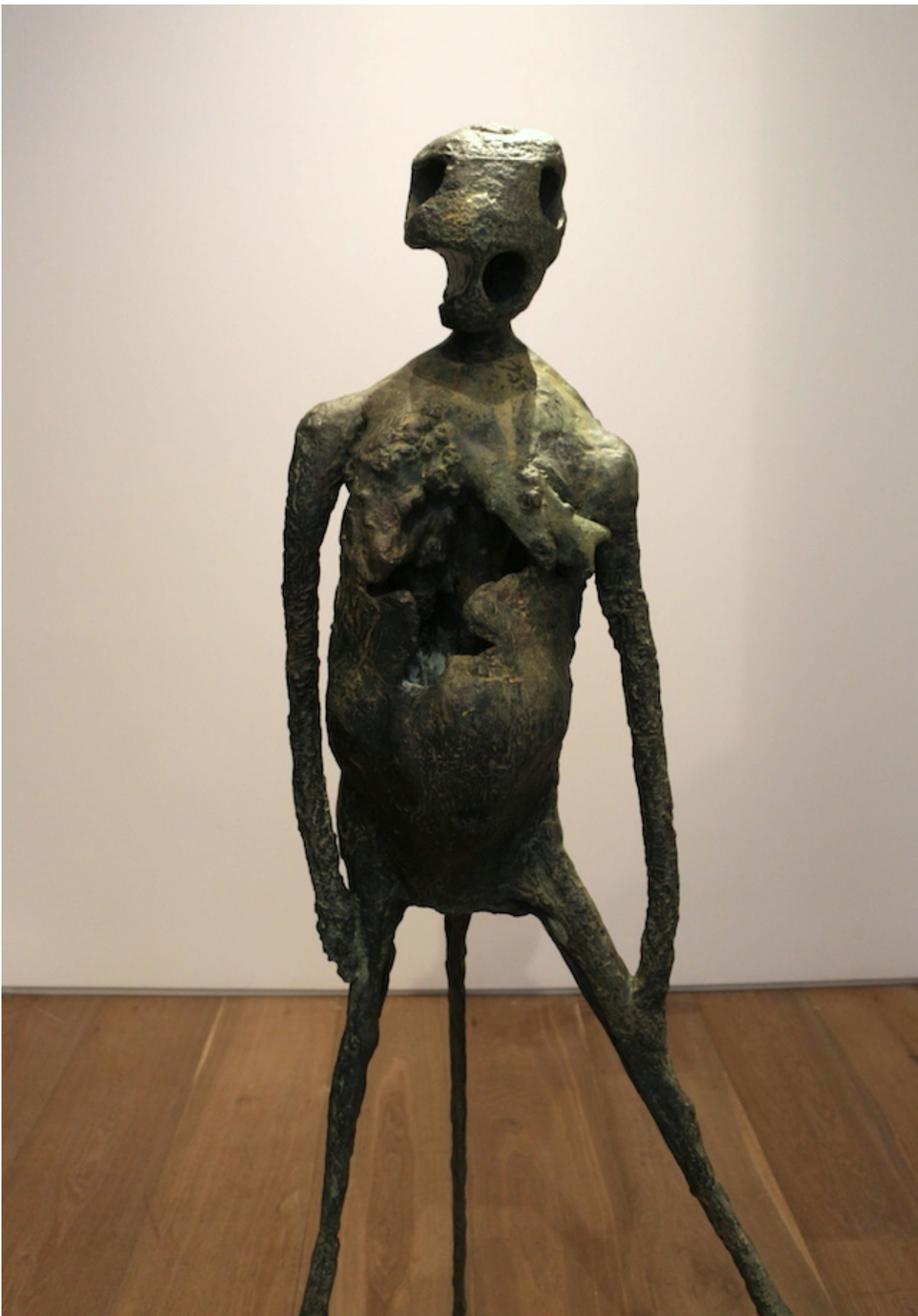
Germaine Richier, "Le Berger des Landes" (1951)