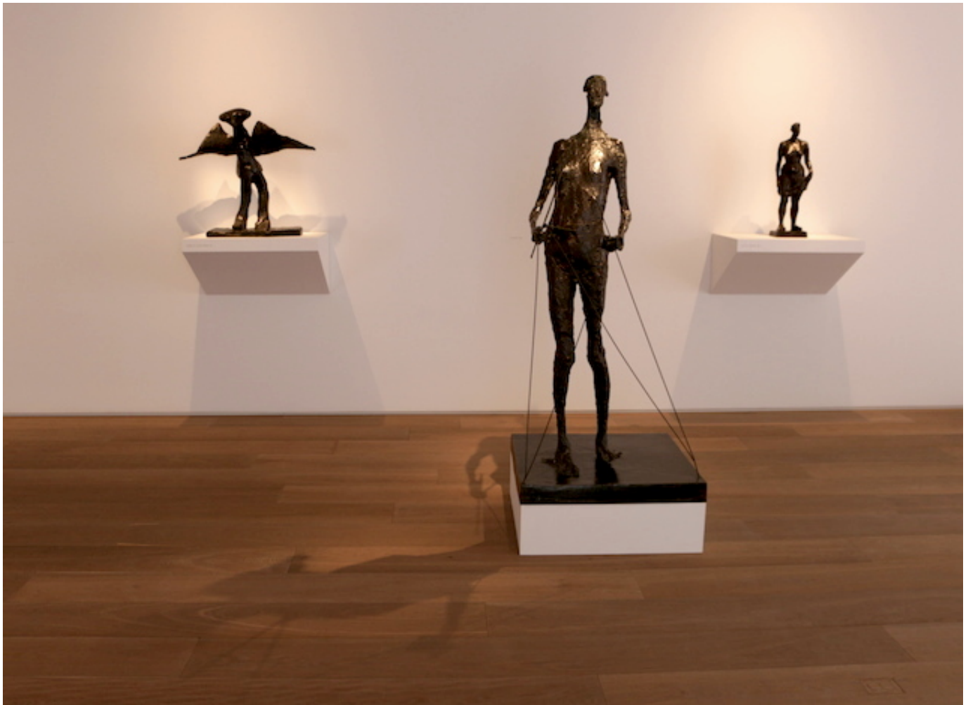
Germaine Richier, installation view

Germaine Richier is on view at Dominique Lévy and Galerie Perrotin (909 Madison Avenue, Upper East Side, Manhattan) through April 12.