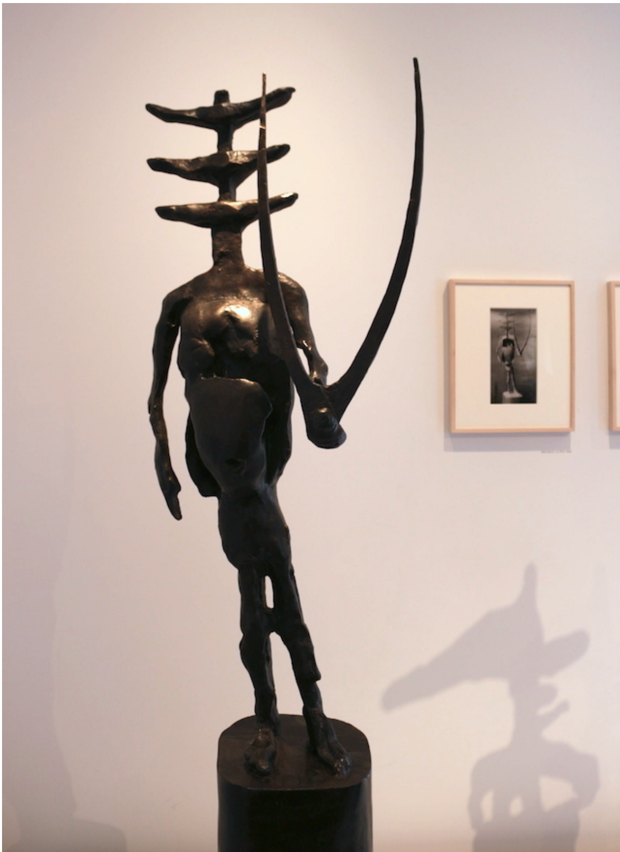
Germaine Richier, partial installation view of 'L'Echiquier, grand' series of large-format chess pieces (photographs of Richier's work by Brassai in the background)