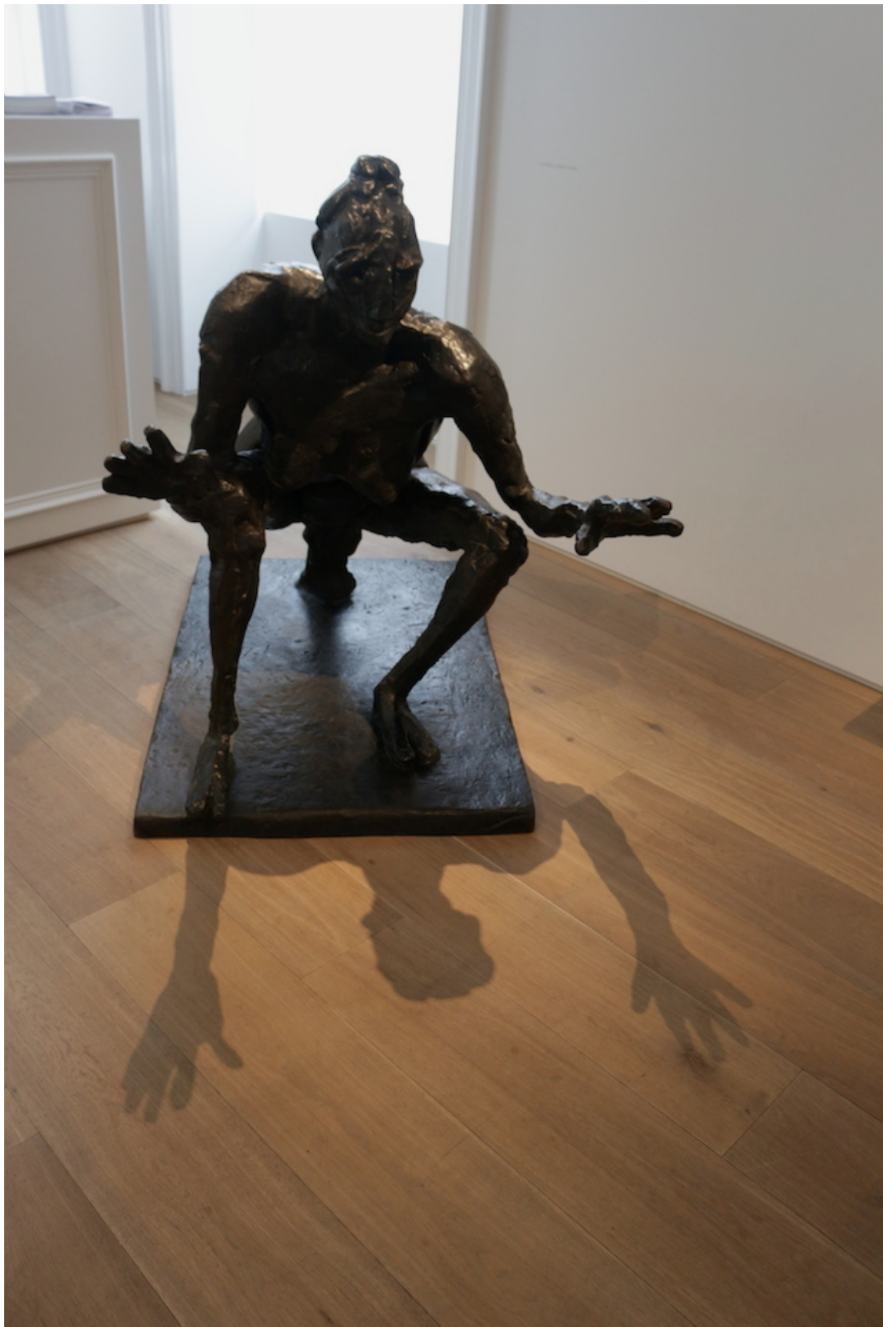
Germaine Richier, "La Sauterelle, grande" (1955-56)