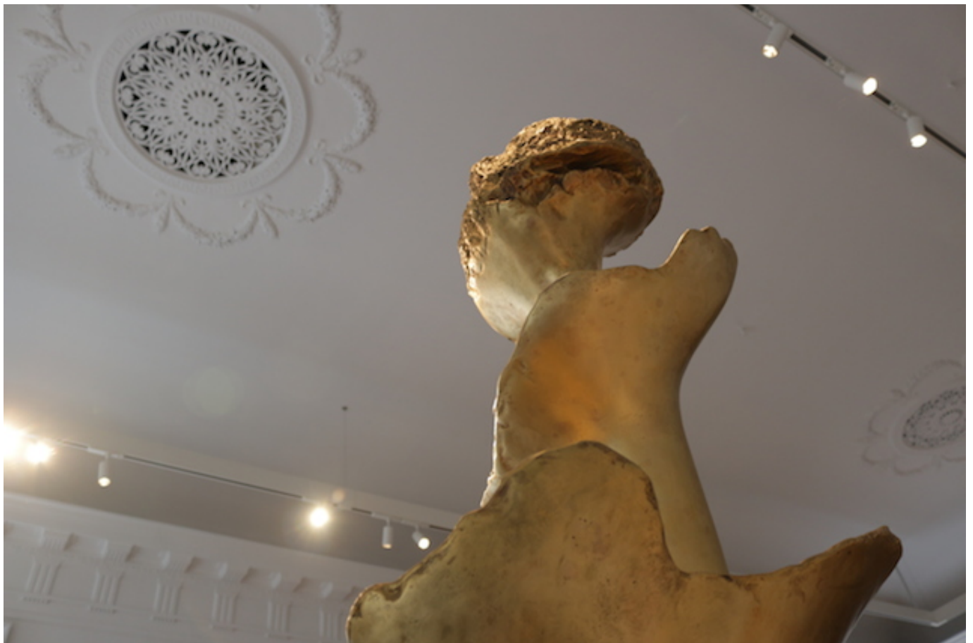
Germaine Richier, "La Spirale" (1957)