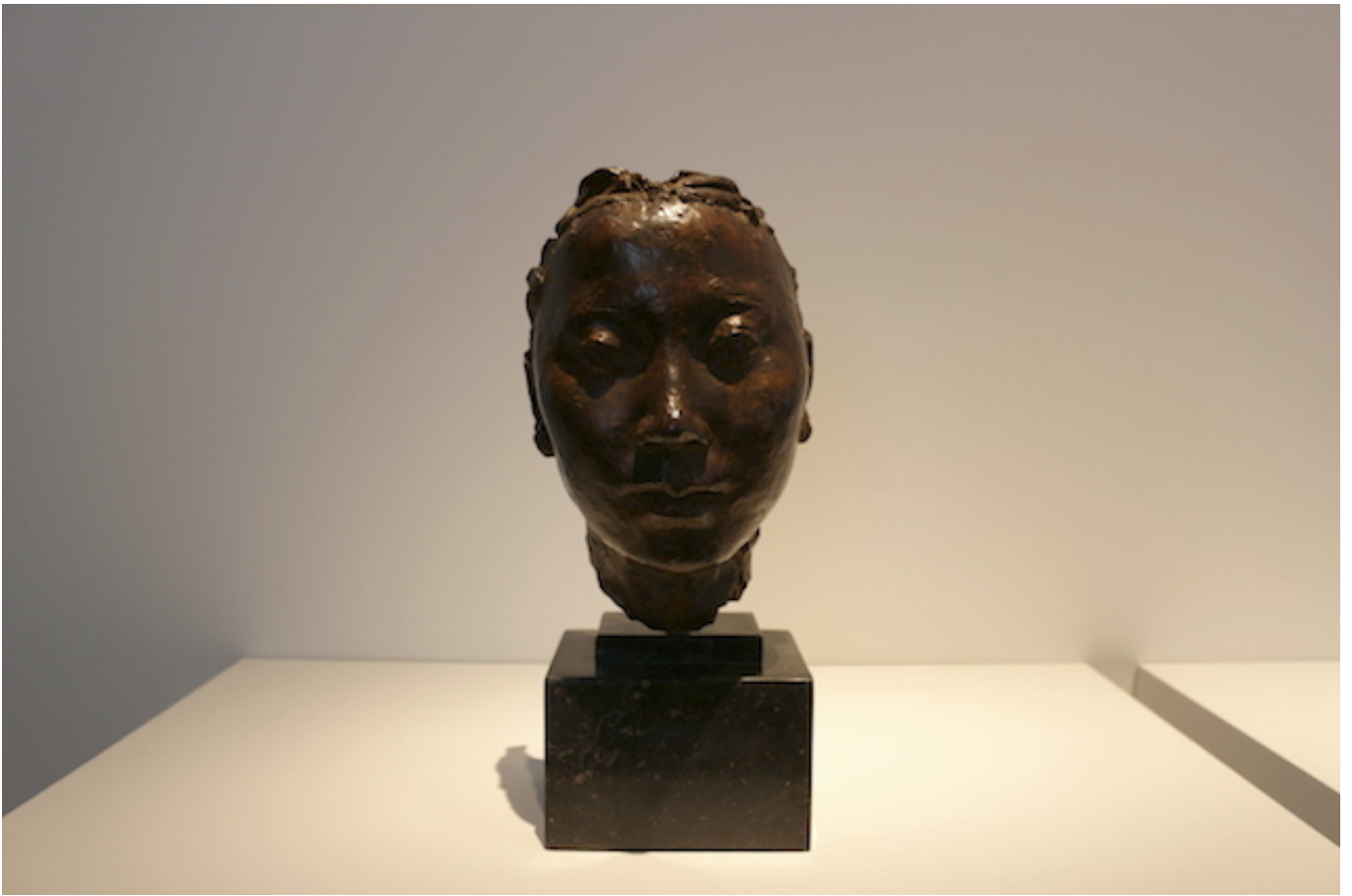
Germaine Richier, "La Chinoise" (1952)