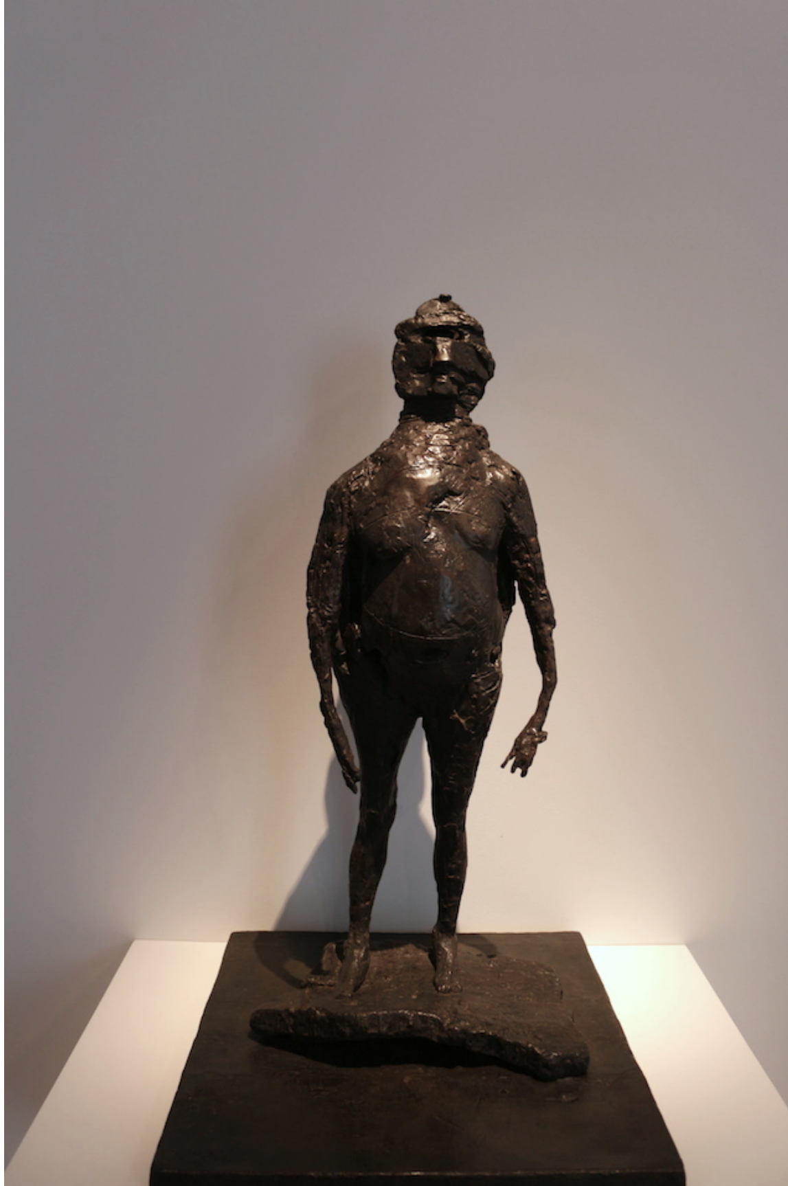
Germaine Richier, "Le Pentacle" (1954)