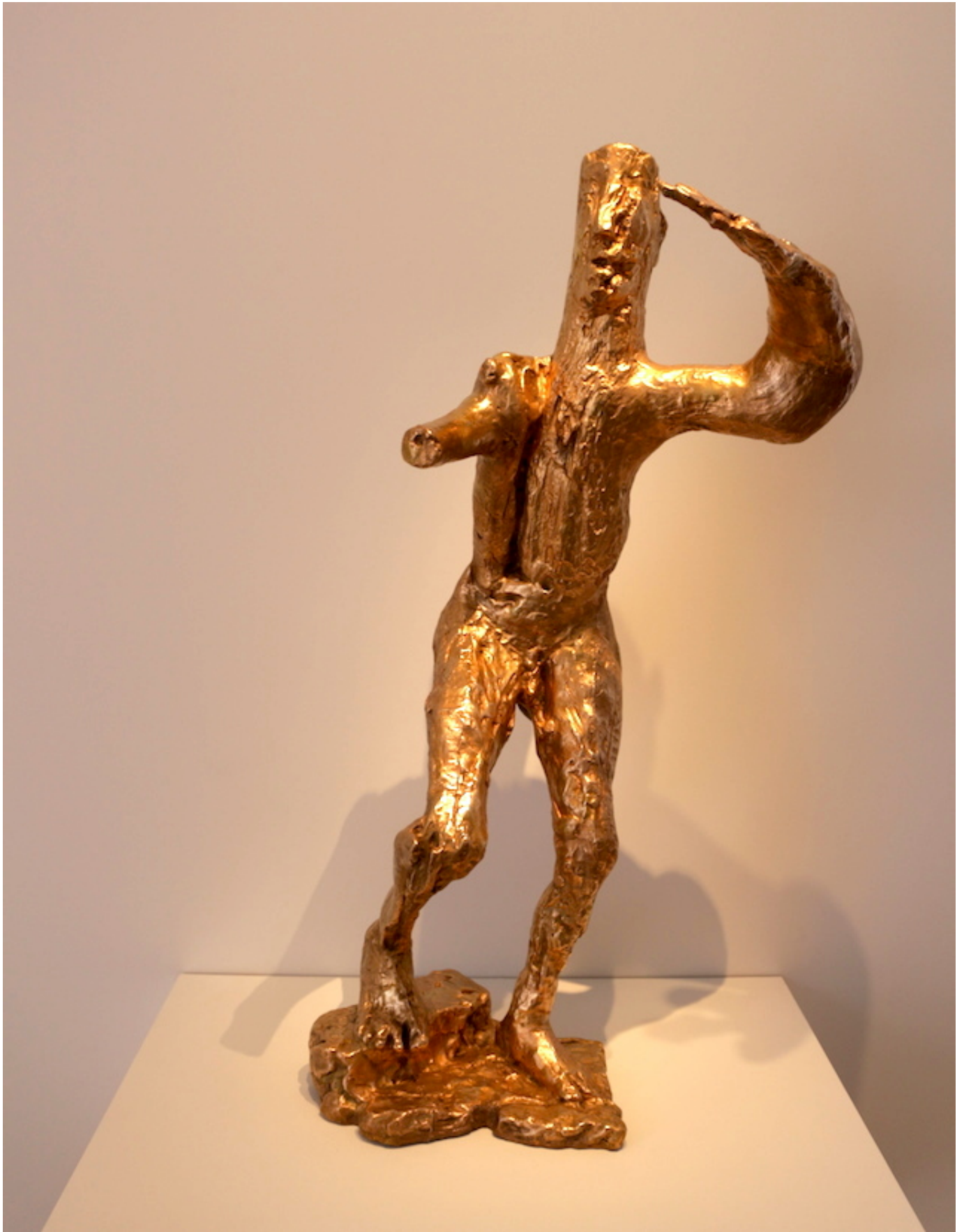
Germaine Richier, "L'homme-forêt, grand" (1945-46)