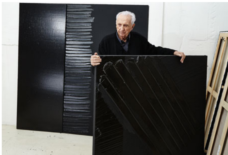
Pierre Soulages, aka 'the man in black'

His father had been an artisan who died when he was only five, and it was as if Soulages was rediscovering the artisanal heritage of the world in which he was reared. The simplicity and honesty of these materials were also perfectly suited to post-war existential austerity. Thus, remarkably soon, aged only 27, he found himself included in key exhibitions of new abstract art.