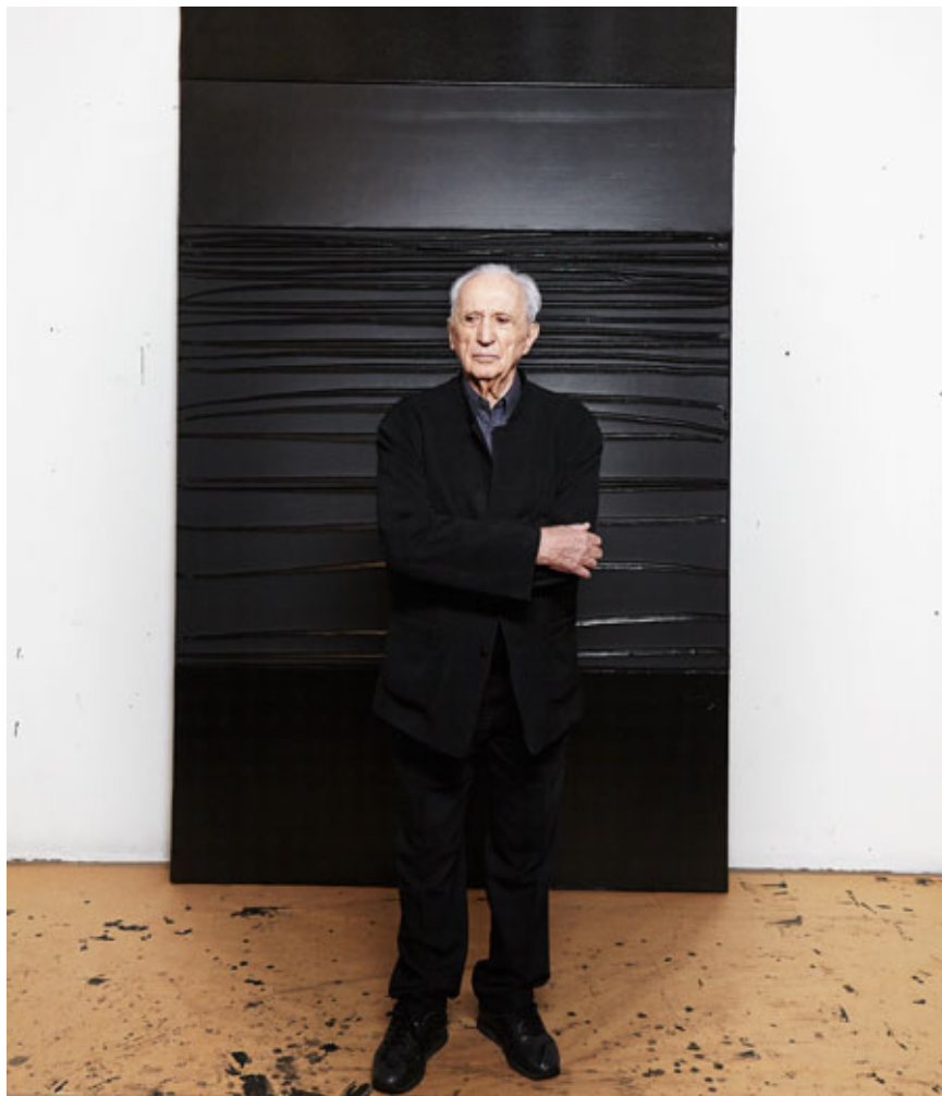
Pierre Soulages