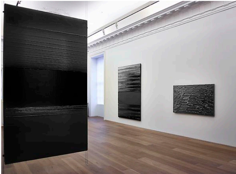
Pierre Soulages, First Floor Installation View at Dominique Lévy NYC, Soulages Archives, 2014.