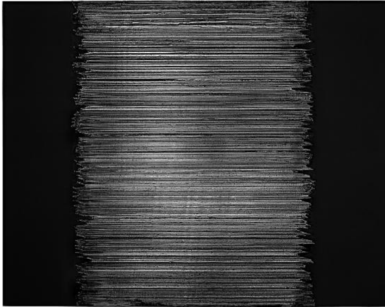
Pierre Soulages, Peinture 175 x 222 cm, 23 Mai 2013. Soulages Archives, 2014.

So again, what is there to see in a canvas painted in black? Well, you quickly stop seeing the color black. Instead, you look for what else is present: the texture, the reflected light, and the volume of the work. You see beyond black. Monochromes usually reward closer exploration, and that is the case here.