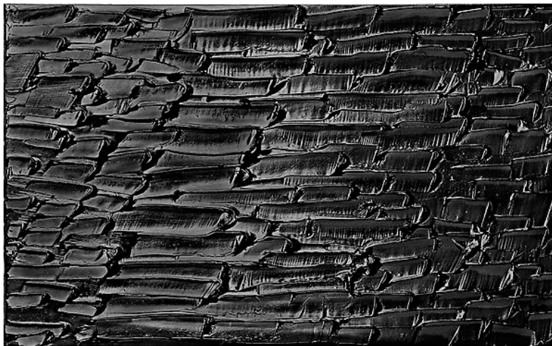
Pierre Soulages, Peinture 102 65 cm, 17 Juillet 2013. Soulages Archives, 2014.

This exhibition reintroduces the now 94-year-old Soulages to the American market. He hasn't been idle. In fact, he was too busy preparing for the impending opening of the new Musée Soulages in Rodez, France to attend the exhibition preview and opening in person, but he made the time to join by Skype. The show in New York includes fourteen new "Outrenoir" paintings, which mark a clear evolution from his early works. These are part of a 35 year exploration into monochrome paintings, all of them black, or as he would put it Outrenoir , beyond black.