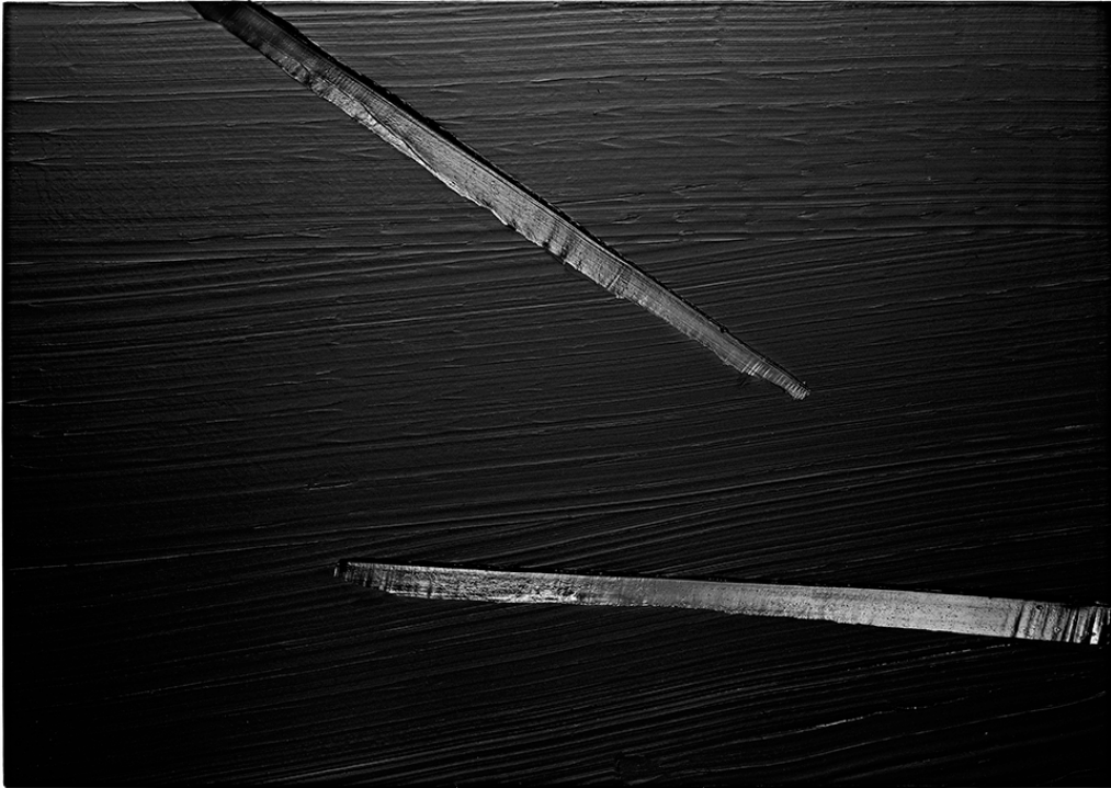
Pierre Soulages, Peinture 157 X 222 Cm, 6 Avril 2013 , Via Dominique Lévy