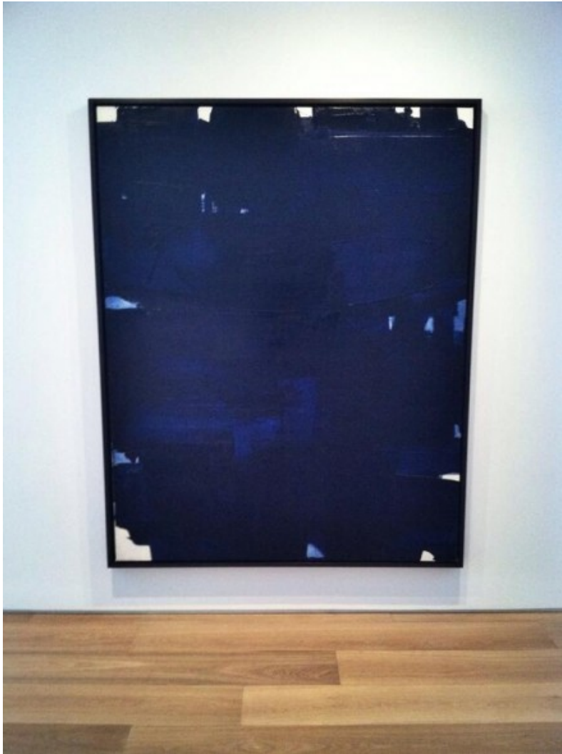
Pierre Soulages, Peinture 202 X 159 Cm, 18 Octobre 1967 , via Art Observed

Including works from the range of his careers, the two gallery show places the artist's ongoing fascination with the powerful sheen and clean capabilities of black paint, but uses his minimal color and mark-making techniques to a strikingly economic final product. Works are defined by dizzying, cross-hatched patterns, or meticulously coating the canvas in a formless, thickly applied coat. Using this as his starting point, Soulages then digs into the surface of the work, creating hard, carved out gashes that allow the light to play across his surfaces in delicate patterns.