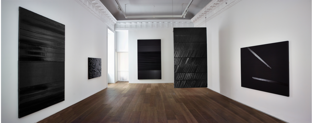
Pierre Soulages (Installation View)

During the exhibition preview, much was made of the artist's fully contemporary approach to painting, and it's hard to argue this point. Soulages work feels wholly present in the contemporary discourse, rather than an important figure in the art historical, or a road marker in post-war abstraction. With this in mind, the top floor of the exhibition serves as a masterful stroke of curating, showing a number of mid-20th century canvases by the artist that serve not only to chart his evolution and development of his immediately recognizable painterly themes, but also to invite a striking comparison to the artist's compatriots.