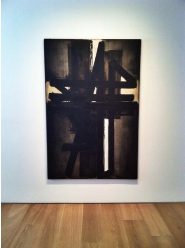
Pierre Soulages, Peinture 195 X 130 Cm, 2 Juin 1953

more embedded in the broader annals of art history than in the practice of one artist. It's a fitting parallel for an artist whose work often draws its strength from its surroundings, letting light and shade dictate the final presentation of the painting's surface. Soulages' work is on view through June 27th.