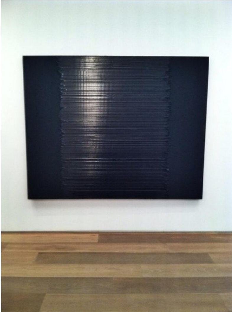
Pierre Soulages, Peinture 175 X 222 Cm, 23 Mai 2013

Held in high regard in his home country of France, and throughout much of continental Europe, the work of Pierre Soulages has never really achieved the same stature in the United States, despite his formal ties to the particularly American strains abstract expressionism and minimalism that have populated his work over the past sixty years. But it's that same lack of recognition that Dominique Lévy and Emmanuel Perrotin are looking to change this spring, bringing a selection of the artist's most recent work, and some of his most classic canvases to show at the pair's uptown exhibition spaces.