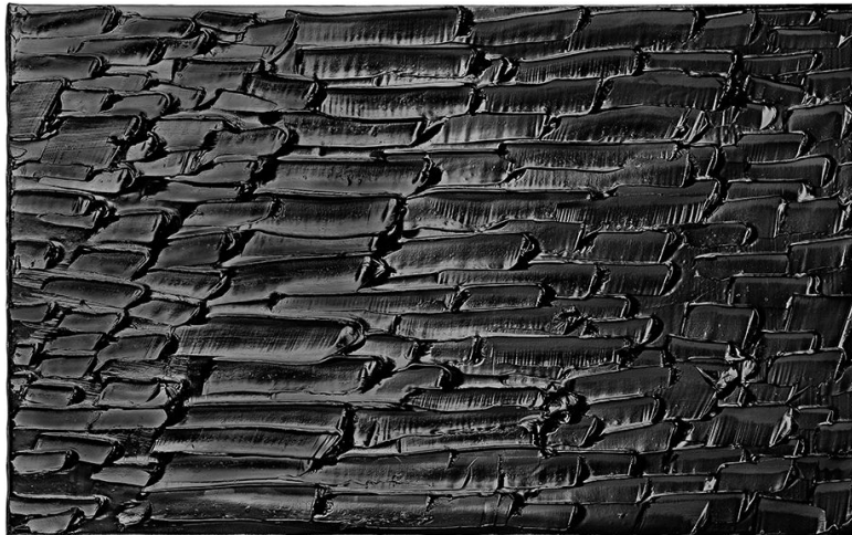
Pierre Soulages, Peinture 102 x 165 cm, 17 juillet 2013 (2013)

Starting at the top, in Lévy's third-floor gallery, a room of 1950s work puts Soulages's career into perspective. These are brushy canvases, wild but also tastefully balanced. In their day, they were often compared to the American painter Franz Kline , who did very similar zig-zags. In this show, these classic works—which include paintings loaned from both private collections and institutions, including the National Gallery in Washington—mainly serve to set off a suite of 14 of Soulages's new “outrénoir” or “ultra-black” paintings in the other galleries. All of the latter are dated 2013, though they continue a series he begun late in his career, in 1979, when he became monomaniacally monochromatic.