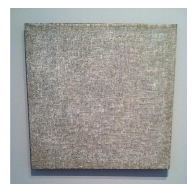
Roman Opalka, Chronome II (1963)

Opalka's exhibition of works is on view through October 18th.