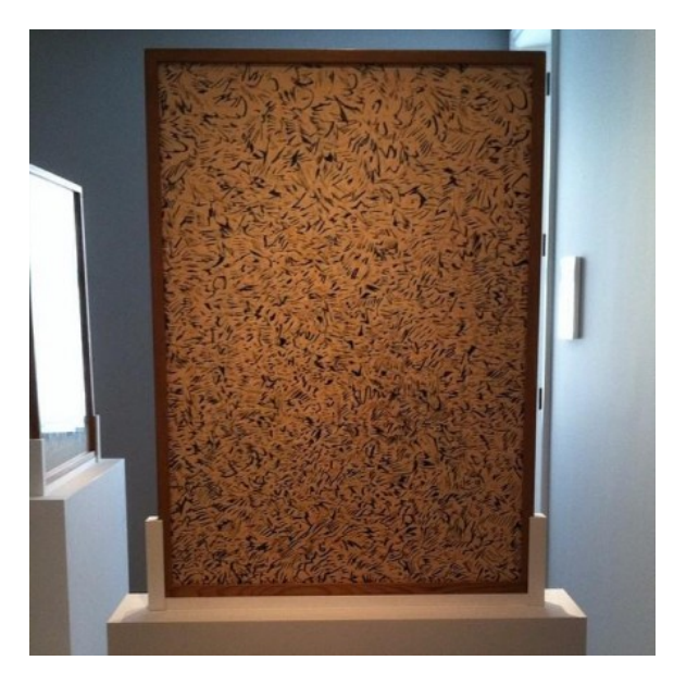
Roman Opalka, Étude Sur le Movement (1959-60), via Art Observed