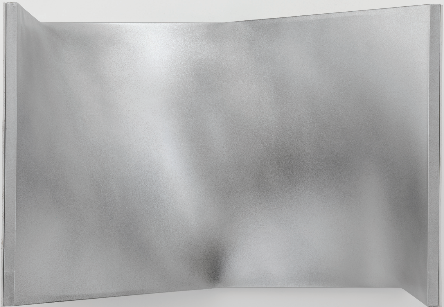
Enrico Castellani. Superficie biangolare cromata , 2011. Acrylic on canvas, 70 x 50 x 100 cm

conception' in which works were devoid of referents and achieved a state of autonomy and objectivity. Castellani was also influenced by the reduced semantics of Piet Mondrian, the all-over compositions of Jackson Pollock, and the spatial explorations of Lucio Fontana, and in his own work sought out a pure and harmonious art form, which goes beyond its physical borders to alter the light and space around it and evoke the infinite.