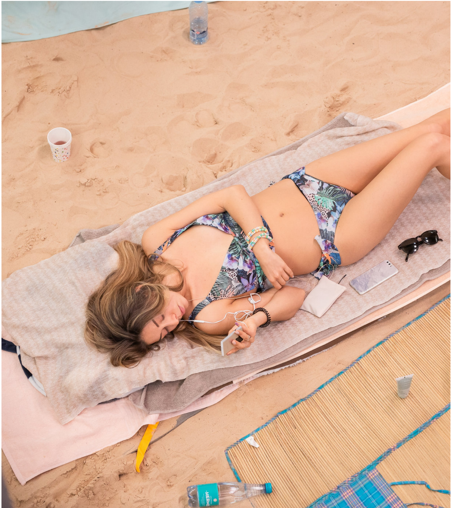
One of the cast of performing characters in “Sun & Sea (Marina).” The installation won the prestigious