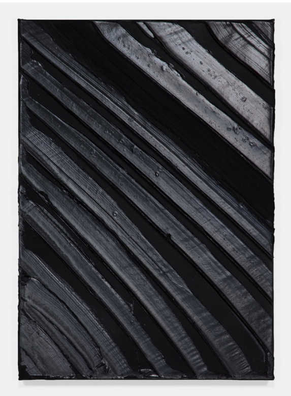
Peinture 81 x 57 cm, 27 septembre 2013, 2013. Acrylic on canvas, 31 7/8 x 22 7/16 inches (81 x 57 cm). © Artists Rights Society (ARS), New York / ADAGP, Paris.

Lévy Gorvy Ground Floor, 2 Ice House Street Central, Hong Kong