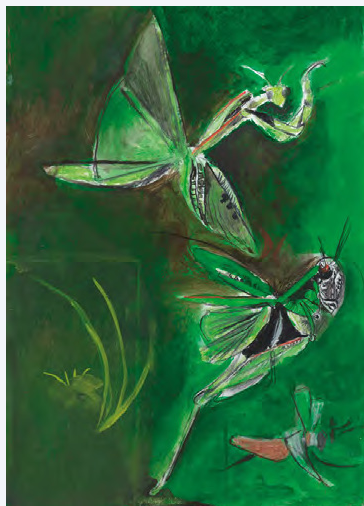
Above: Graham Sutherland's (1903-80) interest in insects such as cicadas, mantises and grasshoppers began after his move to the south of France in the late 1940s. Sauterelles (1974) is priced at £24,000 from Christopher Kingzett Fine Art.