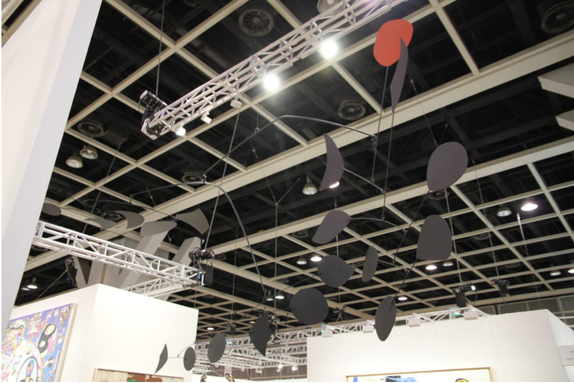
Alexander Calder. Rouge Triomphant (Triumphant Red) (1959-1963).