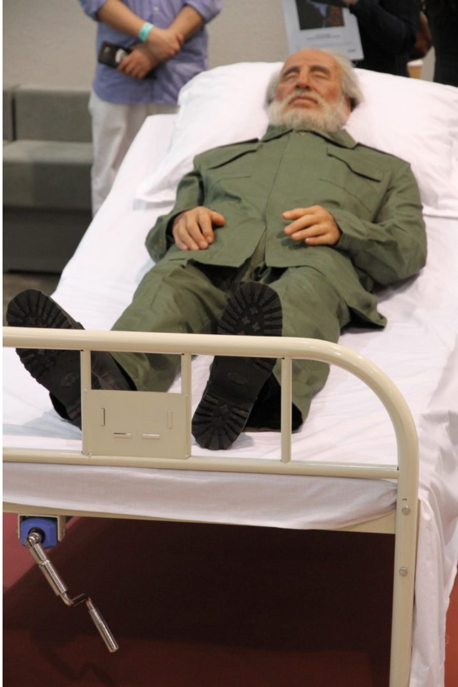
Shen Shaomin Summit (2009–10).