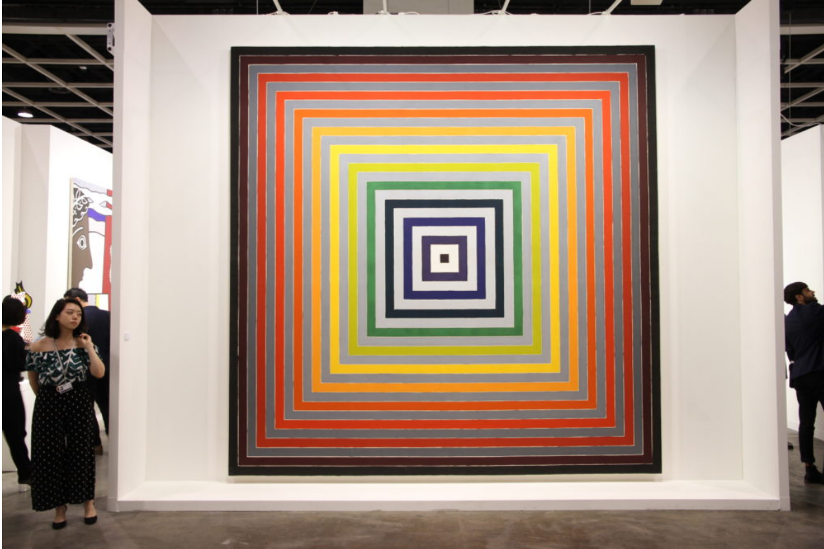
Frank Stella Lettre sur les sourds et muets I (1974).