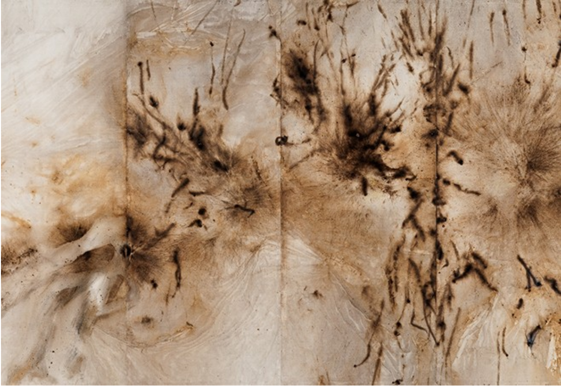
Cai Guo Qiang Toroko Gorge (2009).