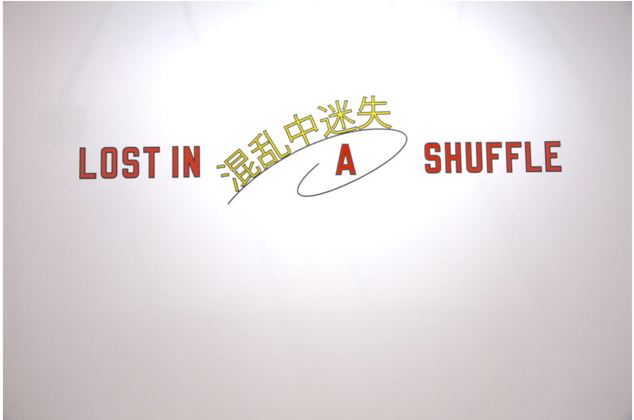
Lawrence Weiner Lost in a Shuffle (2015).