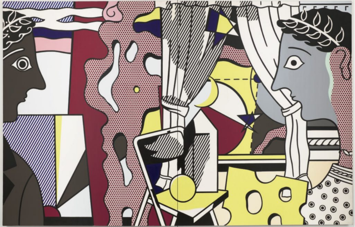
Roy Lichtenstein, Cosmology (1978). Courtesy of Lévy Gorvy, © estate of Roy Lichtenstein/DACS 2017.