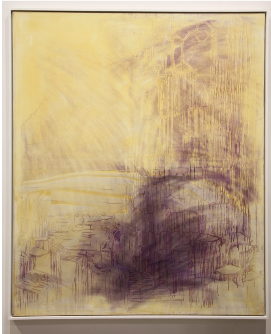
Sigmar Polke Untitled (1982).