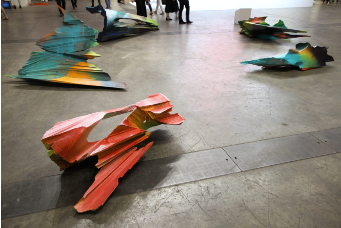
Katharina Grosse Untitled .