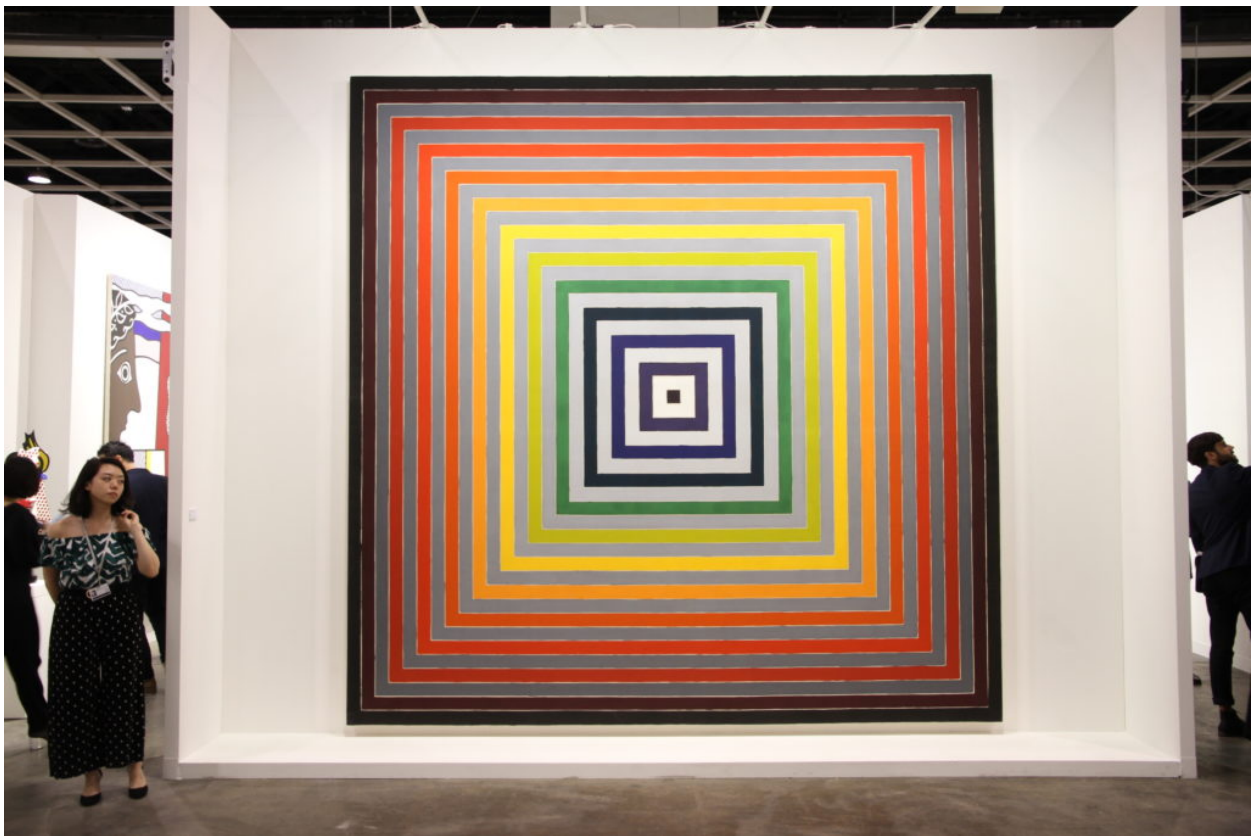
Frank Stella Lettre sur les sourds et muets I (1974).

The fifth edition of Art Basel in Hong Kong started with a VIP preview at the city's convention and exhibition center on Tuesday. With 242 participants, there was an enormous amount of art to take in. Galleries from 35 countries brought offerings from Modern to contemporary and emerging to blue chip.