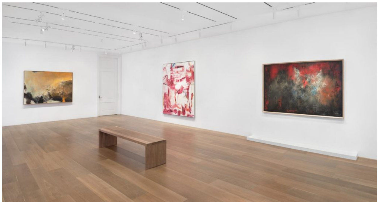
Installation view "Willem De Kooning | Zao Wou-Ki" at Levy Gorvy, New York.

"I felt the time was right to enter the gallery because I grew tired of the constant competitiveness of the auction market," Gorvy said. "The real positive aspect of the art market is the creativity of creating exhibitions."