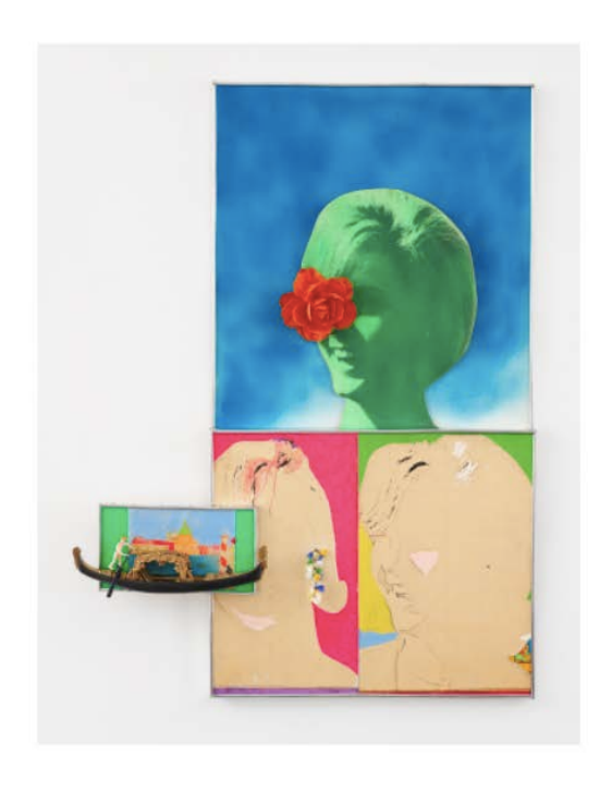
LEFT: NOW, 2017, acryl on canvas, 82.28 x 69.09 inches (209 x 175.5 cm). RIGHT: Portrait de Gabriella la jolie vènetienne, 1963, mixed media on canvas, 34 5/8 x 24 7/16 x 3 3/4 inches (88 x 62 x 9.5 cm).

-ary change. But in the late 1970s, he bravely returned to painting with renewed intensity, creating dream-like landscapes and portraits in lush, sumptuous colors. His singular and prolific painting practice has continued to the present day, defined by increasingly large-scale compositions layered with allusions to art history, mythology, and literature, with a particular emphasis on portraiture. Contemporary artists, including many at mid-career, have demonstrated a renewed interest in figuration. Raysse's oeuvre may be credited as a significant source of inspiration for this new generation.