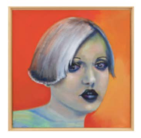
TOP : QUE VEUX TU DIRE MON BEL AMI, 2017, oil on canvas, 44 1/2 \times 35 7/16 inches ( 113 \times 90 cm). MIDDLE : Un beau merle, 2008, acryl on cardboard, 31 1/2 \times 23 \% inches ( 80 \times 59 cm). BOTTOM : Songeuse Roxane, 2013, distemper on canvas, 24 13/16 \times 24 13/18 inches ( 63 \times 63 cm).