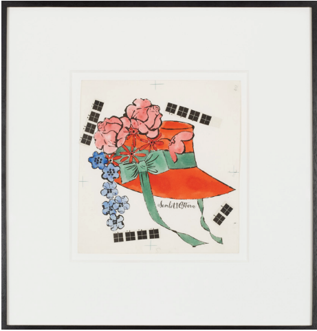
ANDY WARHOL Scarlett O'Hara ("Who's Who in Holiday Hats") c. 1958